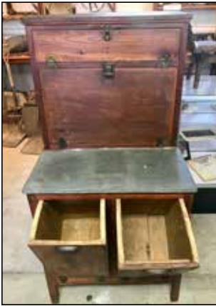
Vintage Pie Cabinet with zinc top