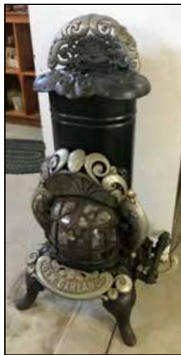
Cast iron Parlor Stove with isinglass, circa 1890's