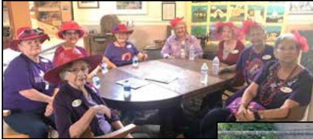
Red Hat Society